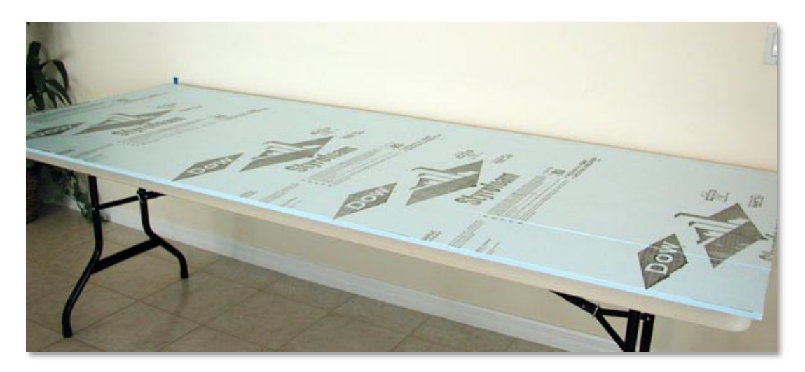
Thin Styrofoam Sheet

The completed background consists of 12 tiles, covering an area of 10 in by 8 ft (25.4 cm by 2.44 m). It can be mounted on wood, or a thin (1/2" inch thick) Styrofoam sheet. The Styrofoam is sturdy enough, and a lot lighter. You can find Styrofoam sheets at your local home center store, in the insulation isle.