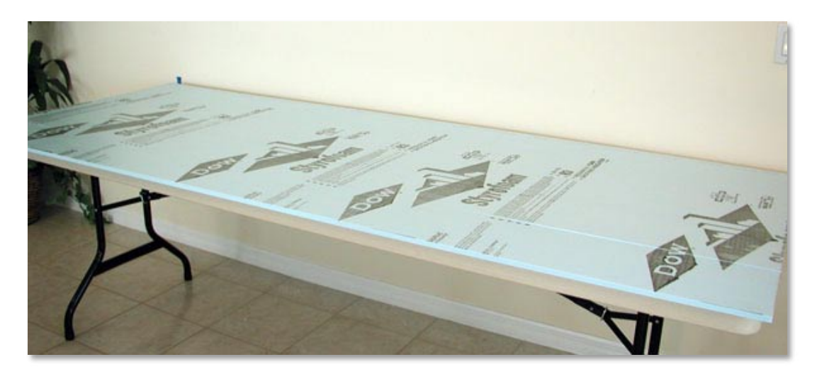
Thin Styrofoam Sheet

The completed background consists of 12 tiles, covering an area of 10 in by 8 ft (25.4 cm by 2.44 m). It can be mounted on wood, or a thin (1/2") inch thick) Styrofoam sheet. The Styrofoam is sturdy enough, and a lot lighter. You can find Styrofoam sheets at your local home center store, in the insulation isle.