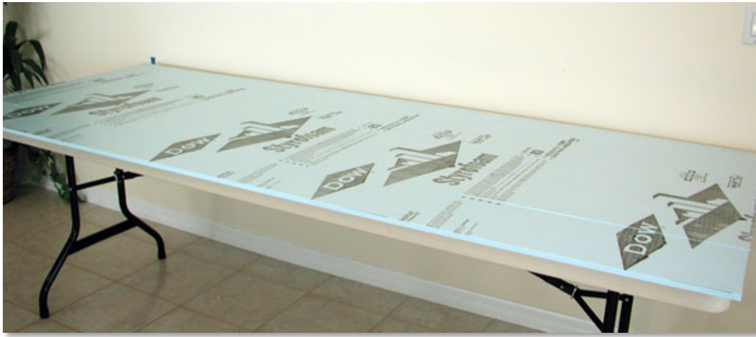
Thin Styrofoam Sheet

The completed background consists of 12 tiles, covering an area of 10 in by 8 ft (25.4 cm by 2.44 m). It can be mounted on wood, or a thin (1/2" inch thick) Styrofoam sheet. The Styrofoam is sturdy enough, and a lot lighter. You can find Styrofoam sheets at your local home center store, in the insulation isle.